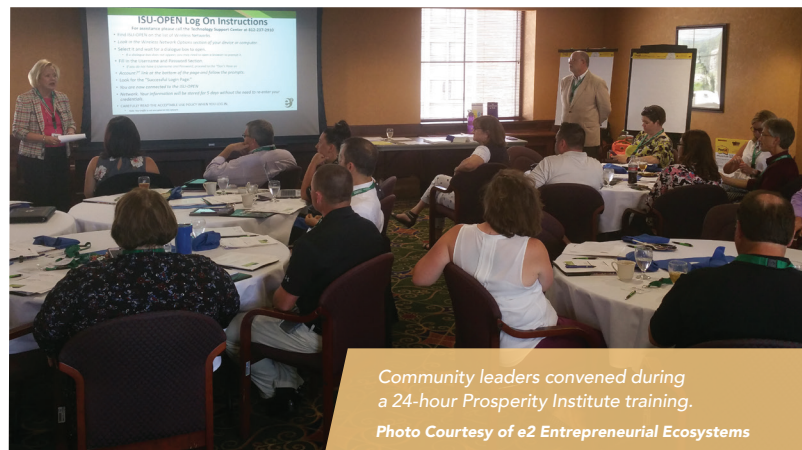
Community leaders convened during a 24-hour Prosperity Institute training.