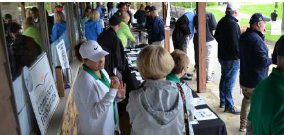
For a complete listing of sponsors and winners, please visit wvcf.com/springgolfouting .