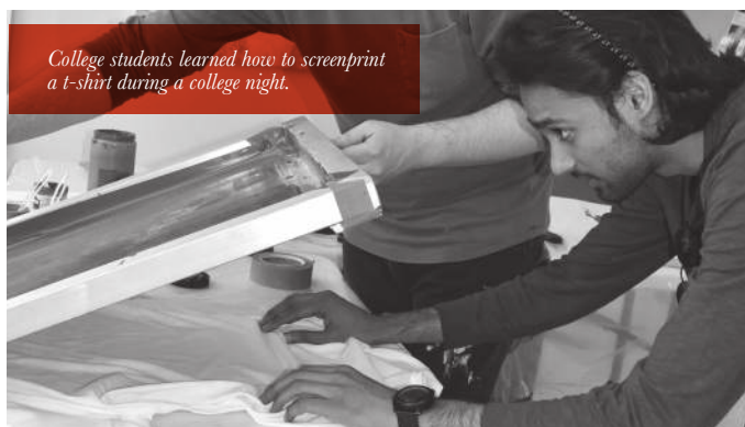
College students learned how to screenprint a t-shirt during a college night.

from the 100 Women Who Care Endowment Fund, Lavelda M. Goble Endowment Fund, Donald O. Springman Endowment Fund and Salo and Mary Levite Endowment Fund. This grant allowed the Swope to host fun and engaging events, as well as to invite students to think of the Swope as a place where they are always welcome. Through this grant, the Swope was able to nearly double the number of the students reached by the Museum in the previous year.