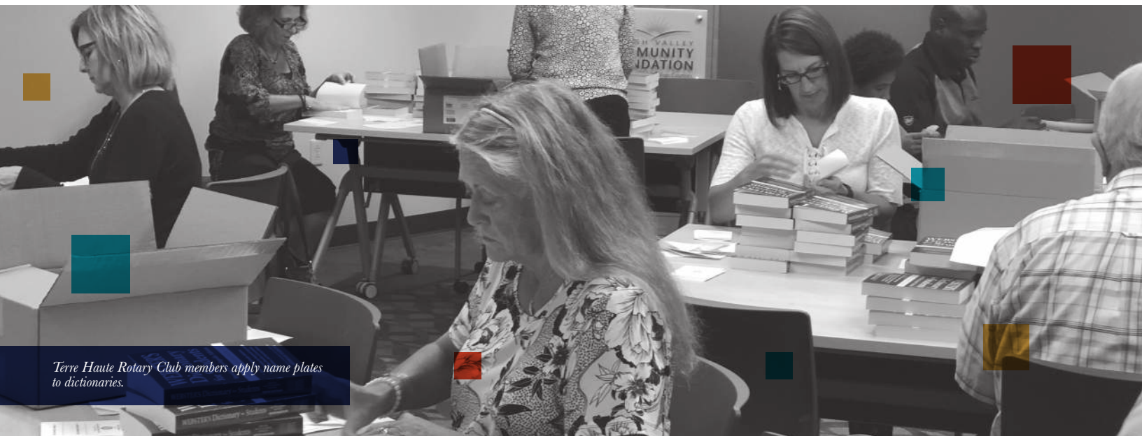
Terre Haute Rotary Club members apply name plates to dictionaries.

For more information on The Dictionary Project, or to create an endowed Dictionary Fund, please contact the Community Foundation at 812.232.2234.