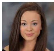
VIGO COUNTY LECS