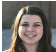
CLAY COUNTY LECS