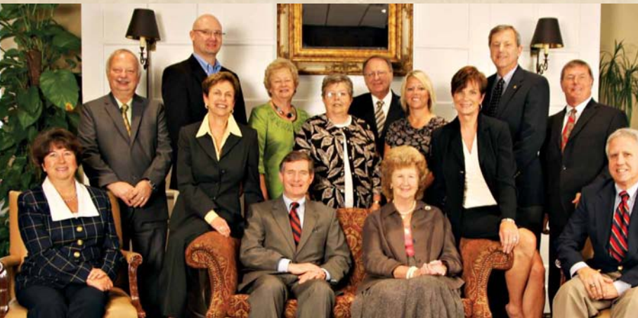
Wabash Valley Community Foundation Board