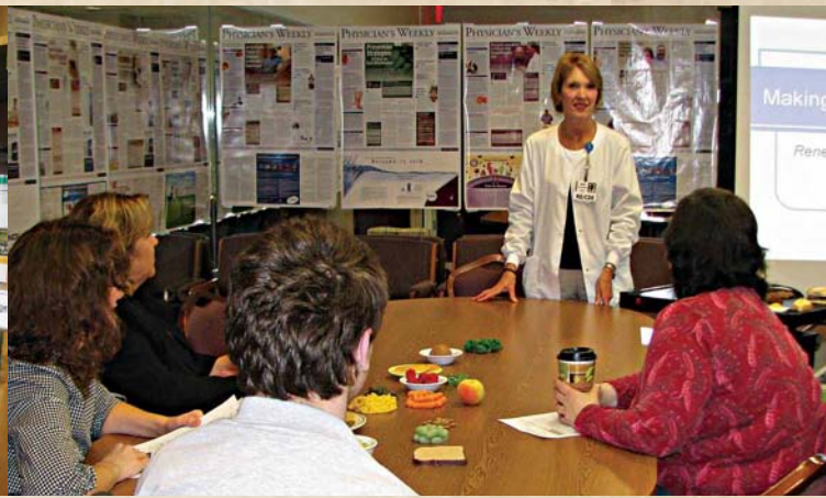
Union Hospital's Diabetes Education Center offers pre-diabetes education courses.