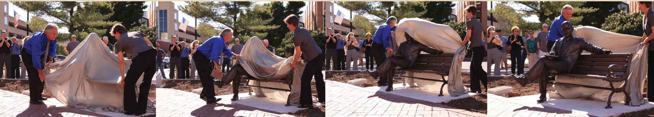
Max Ehrmann's statue is unveiled in a public ceremony.