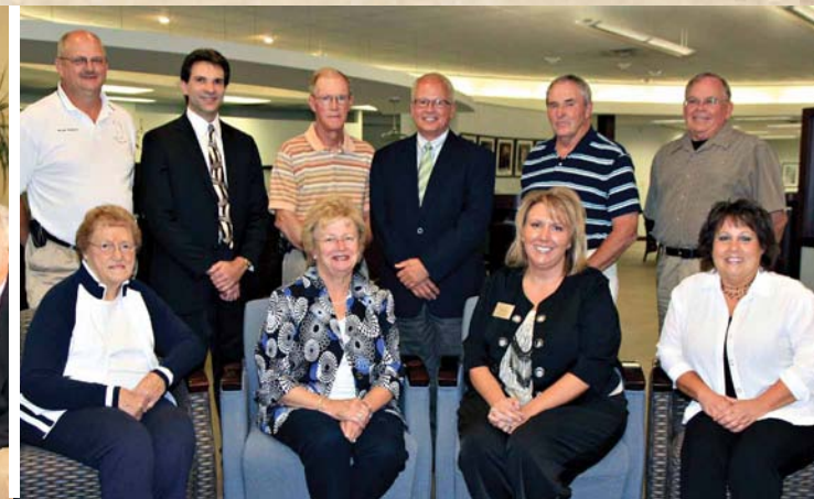
Clay County Community Foundation Board