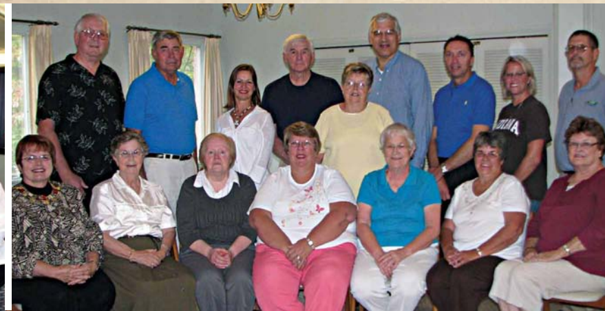
Sullivan County Community Foundation Board