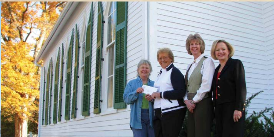
The Poland Historical Chapel check presentation