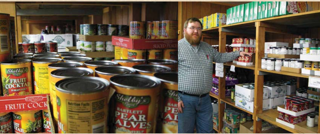
Our Father's Arms food pantry in Sullivan County.