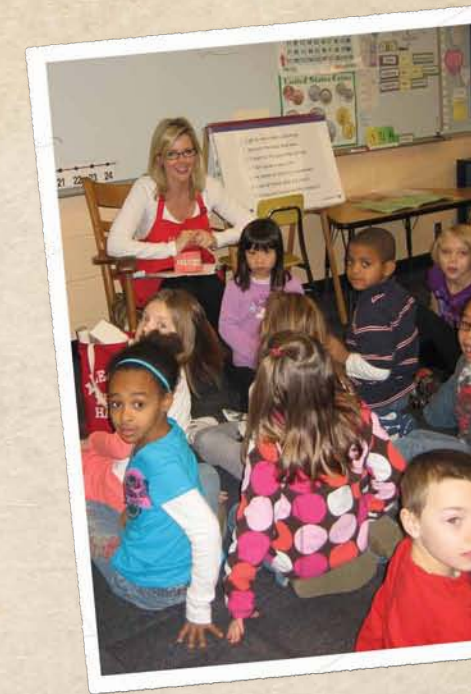
BRIGHTER SMILES, BRIGHTER LIVES