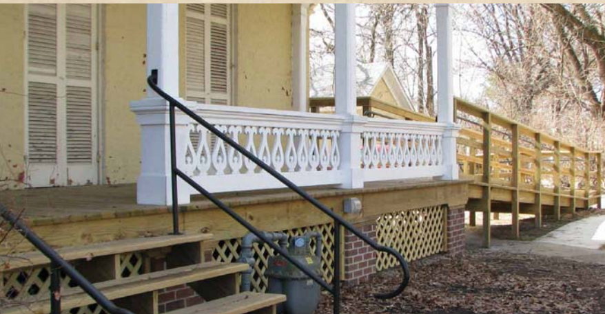
The new porch at the Vigo County Historical Museum